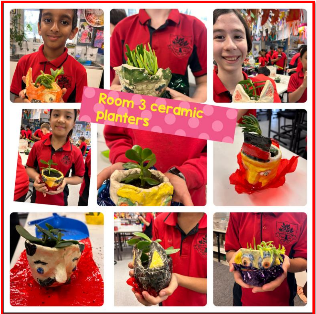
Room 3 ceramic planters