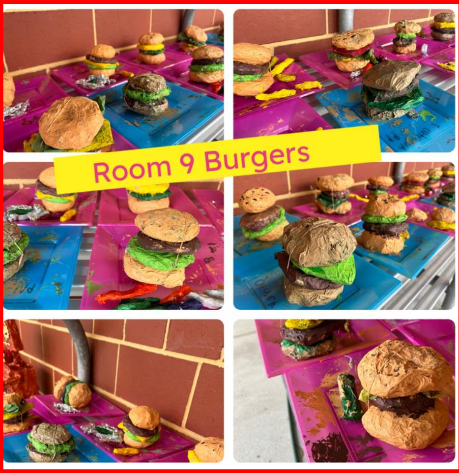
Room 9 Burgers