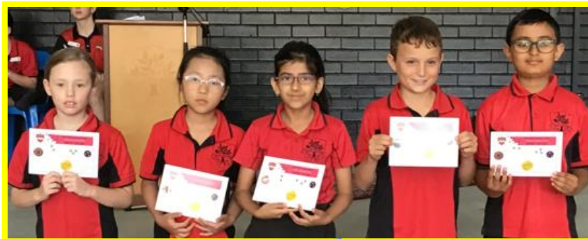
Art Awards: ... and ... Music Awards