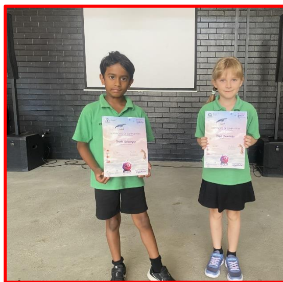
Two of our junior students received recognition this week for participating in the 2023 Premiers Reading Challenge. Well done!

We proudly acknowledge the efforts of Week 3's Value Card winners.