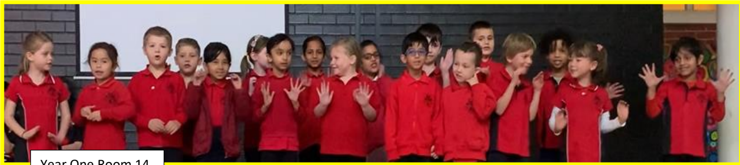
Year One Room 14

We videoed the Year ones and posted the videos to your class Connect – have you seen the videos? They are awesome!