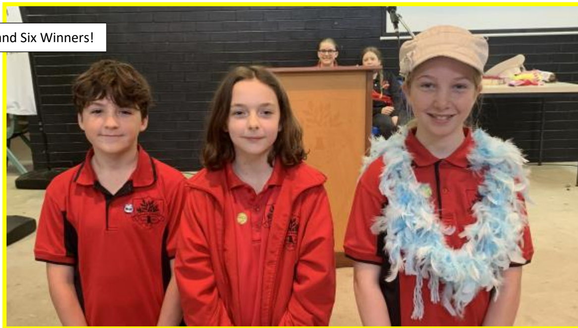
Years Four, Five and Six Winners!

PS IF you have trouble with the Connect Now pp please come in to our front office and let us help you Connect with the school and your class. You may need to If your Connect Now app works fine but it's a password problem, email me beverly.innes@education.wa.edu.au and I will reset it in a key stroke – no problems!!