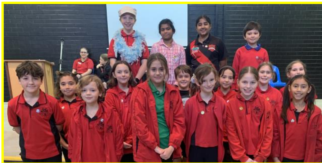
Years Four, Five and Six Class Representatives