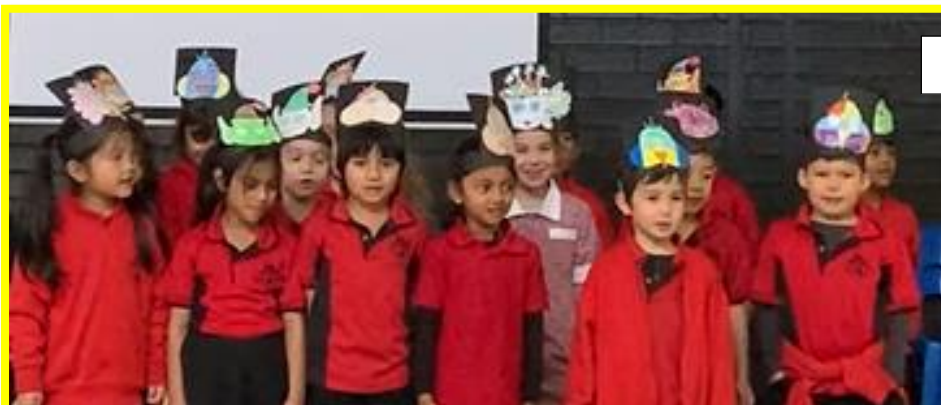
Year One Room 15