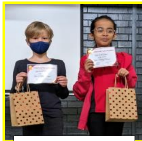
Year Two and Three winners!

A Palaver (Yr 2-6) is a competition-style event where classroom representative students will compete to win against the other students in their year level. Students will be judged using the curriculum-based public speaking rubric, and winners were announced on the day.