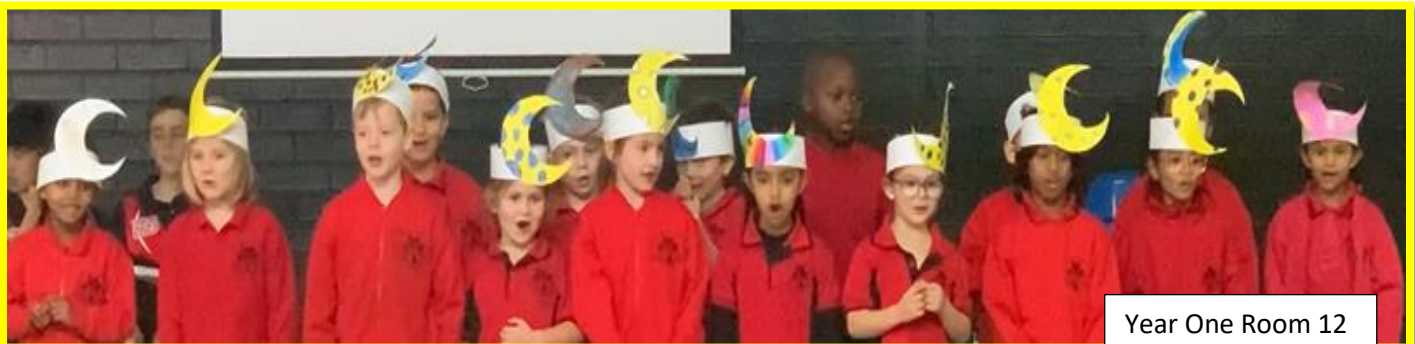
Year One Room 12

We videoed the Year ones and posted the videos to your class Connect – have you seen the videos? They are awesome!