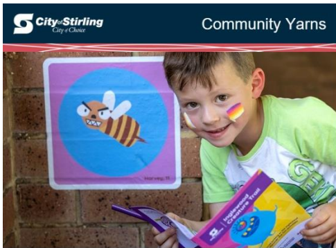
Inglewood Creature Trail

Have a look at the latest City of Stirling publication – full to the brim of great activities across our local area that may pique your interest 😊.