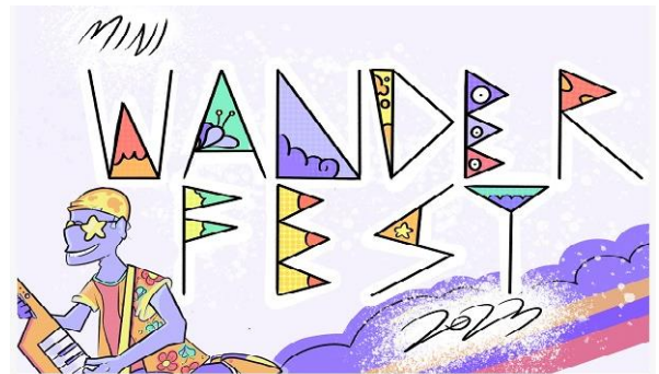
Mini Wanderfest - Youth Week

Have a look at the latest City of Stirling publication – full to the brim of great activities across our local area that may pique your interest 😊.