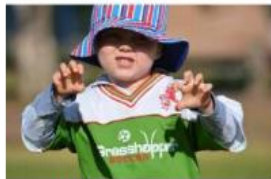
OUTDOOR SOCCER FUN!

grasshoppersoccer.com.au perth@grasshoppersoccer.com.au https://www.facebook.com/grasshoppersoccerperth grasshopper_soccer_perth