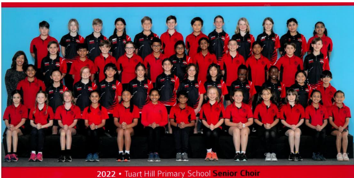
2022 • Tuart Hill Primary School Senior Choir