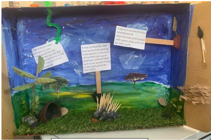
Porcupines by Elnathan

The students in Room 7 have been learning about the animals and habitats in Africa and Europe. They finished off their unit by designing a 3D poster to highlight the conservation needs of their chosen animal. Here are some examples of their work. Wow – all the 3D Posters look AMAZING!!