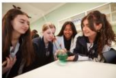
Academic Extension Program