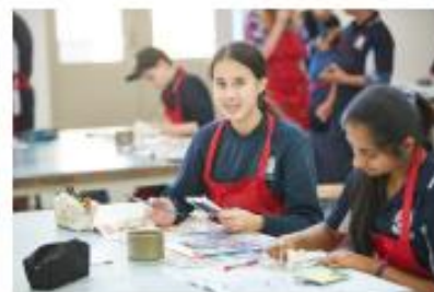
Gifted & Talented Art Program